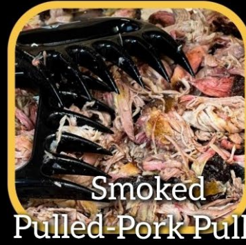
Smoked Pulled-Pork Pulled